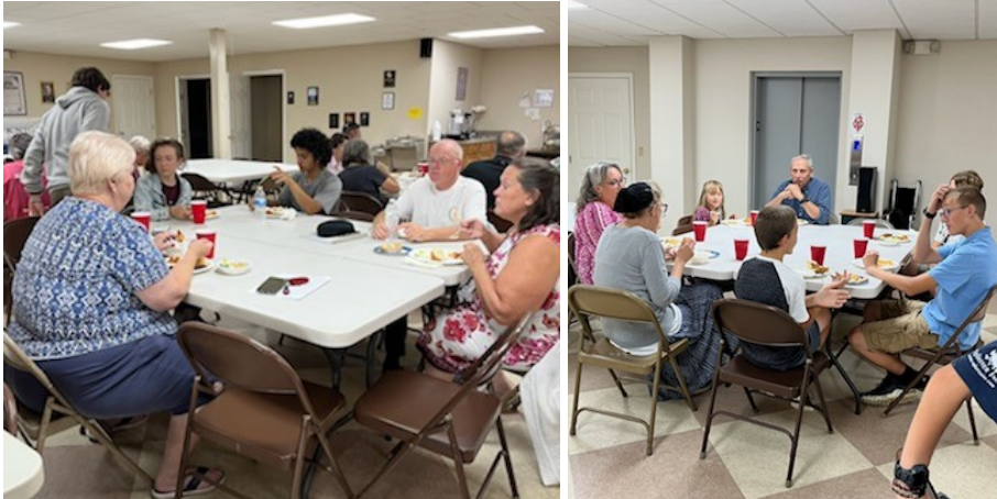
Socializing at Wednesday Fun Night

120 N Gatewood St., Lawrenceburg, KY 40342